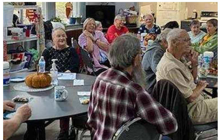
Seniors who have birthdays in September celebrating a collective birthday party at the Coalport Center for Active Living.