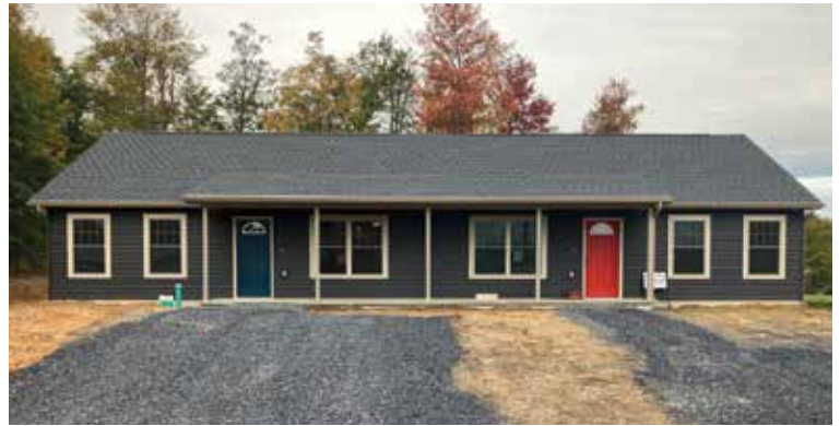
Completed home at the Village of Hope.

for more information on giving to the Mature Resources Area Agency on Aging.